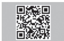
Code for success