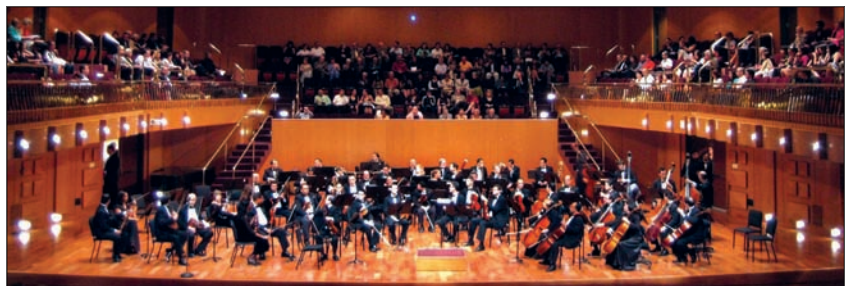
Symphony Orchestra of Puerto Rico on stage at the new Sala Sinfonica Pablo Casals in San Juan.

For more information about Sala Sinfonica Pablo Casals symphony hall or the acoustical consulting services of Acentech, please visit www.Acentech-StudioA.com .