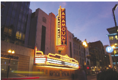
555 Washington Street - Boston, MA

Acentech Inc., BOND and Elkus|Manfredi Architects jointly provided consulting, design and construction services for Emerson College's 180,000 s/f Paramount Center project at 555 Washington St. in the Theater District.